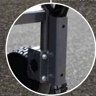
HOSE REEL BRACKET